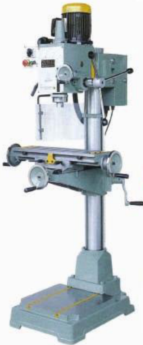
GEM-400GCT (FLOOR TYPE)