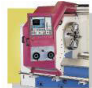
5. CONTACTED 4 POSITIONS