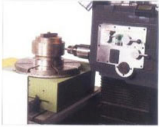
• Cutting Sample