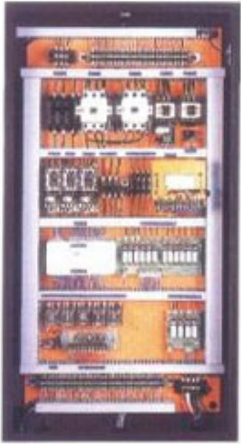
• Electrical Cabinet