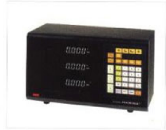
• Digital Monitor